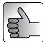
EASY IN USE