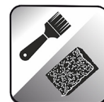
APPLY WITH BRUSH/SPONGE