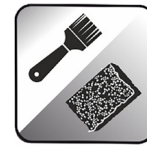
APPLY WITH BRUSH/SPONGE